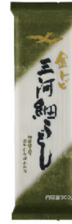
Kintobi Mikawa Hosu Udon