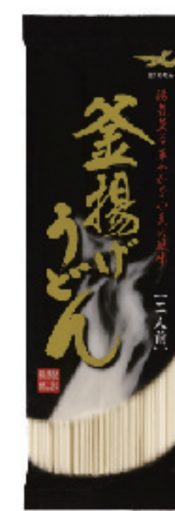
Kintobi Kamaage Udon