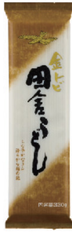
Kintobi Inaka Udon