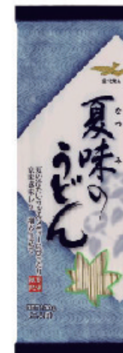
Kintobi Natsumi Udon