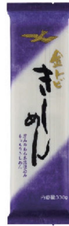
Kintobi Kishimen noodle